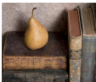
DENVER MEDICAL TIMES, VOLUME 20...